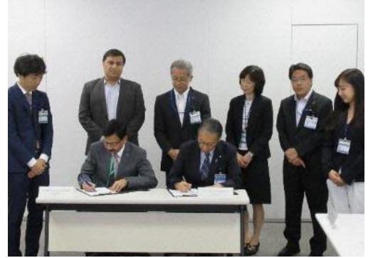
Ceremony for conclusion of MoU (JFY2019)