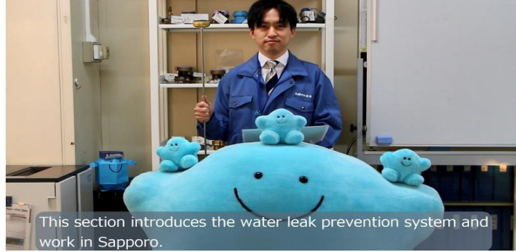
[A scene from teaching video materials]