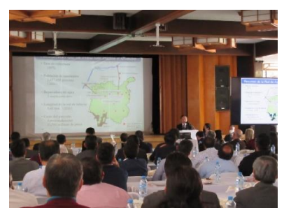
Third dispatch of experts Company Seminar