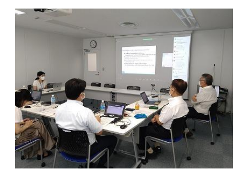
Video lecture and Q&A webinar