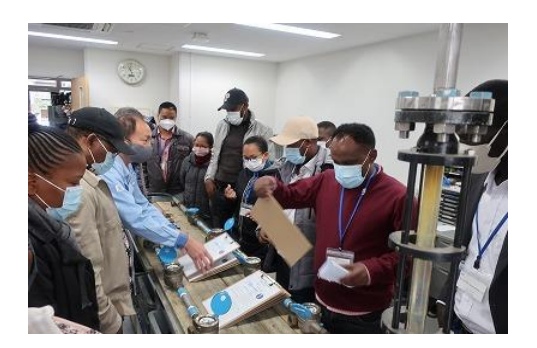
Trainees experiencing error test of water meters