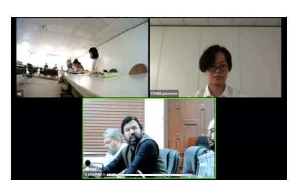
Online seminar participants (JFY2023)