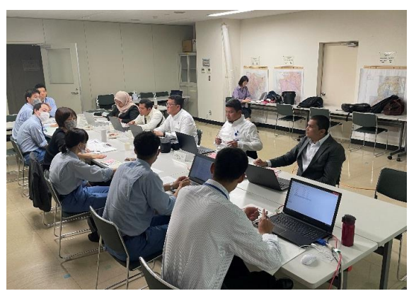
training in Japan