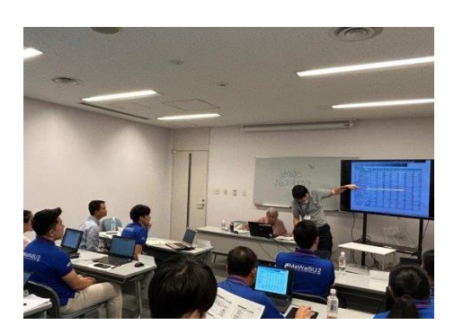
Training in Japan