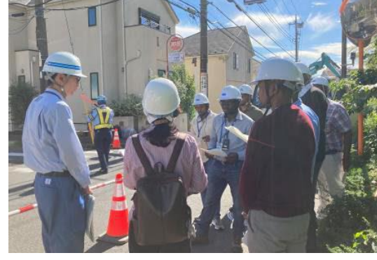
Purification plant visit