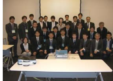
Kick-off symposium 3

academic research and practical action associated with water issues.