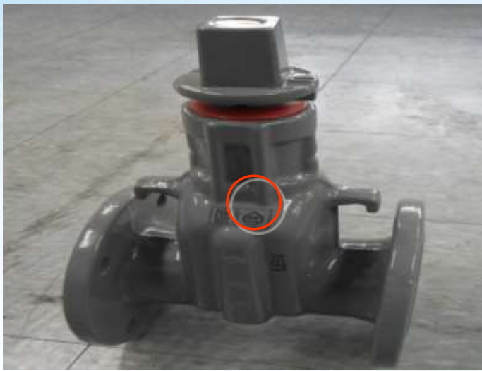
<CP Certified Product>