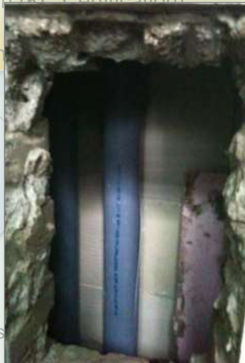
Distortion of PVC Pipe