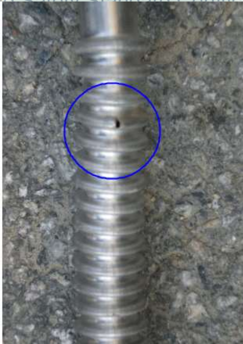
Perforation of Corrugated Pipe

- Performance Certification - Safety Standard Certification