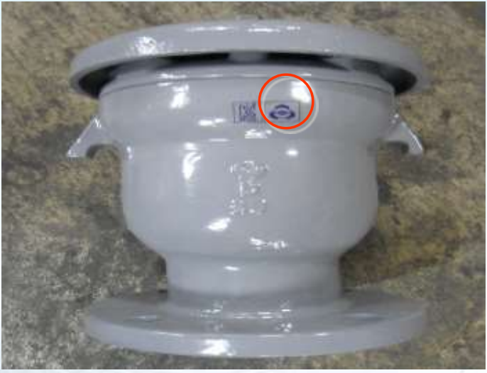
<KWWA Certified Product>