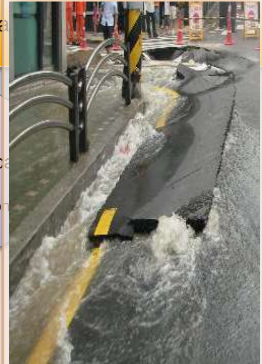
Road Collapse from Water Leakage

※ The accidents due to material defects out of total 172 items of waterworks accidents occurred in Seoul Metropolitan City were 11 items representing 6%. (The Cases of Waterworks Accidents in Seoul, 2010)